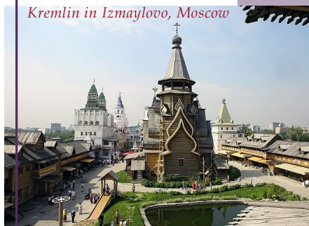
Kremlin in Izmaylovo, Moscow